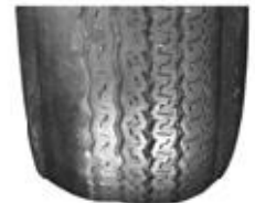
Abnormal tire wear from bad alignment

Vehicle suspensions can wear with age and repeated heavy use. Rough road surfaces and an occasional pothole can change the vehicle's wheel alignment. A wheel alignment can improve your steering control and overall vehicle handling. It can also help prevent abnormal tire wear by bringing the vehicle suspension components back to the vehicle manufacturer's specifications. This important step will keep your vehicle driving the way it was designed to. An alignment is necessary any time a worn suspension part is replaced.