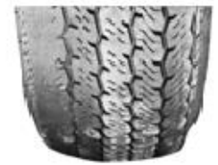
Signs of irregular tire wear

Your vehicle's tires are the only connection between your vehicle and the road. Safe vehicle operation depends on your tires being in good condition. If your tires are neglected, the tread can wear completely away, leaving the tire bald and often exposing the steel cords. Not only is this condition dangerous, it is also unlawful in many states. Tires with an abnormal tread wear pattern can cause the vehicle to shimmy and vibrate, and can adversely affect the manner in which your vehicle performs. A tire with an abnormal tread wear pattern will no longer contact the road the way that it was designed to, and this condition can be dangerous, especially during adverse road conditions.